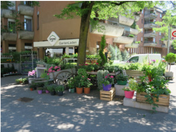
Some impressions of Moserstrasse and the view of Kornhausbrücke

When you arrive at the crossroad Viktoriaplatz you continue to walk along the rails of the tram through Moserstrasse . This might not be the nicest street of the Breitenrain because there is quiet a lot of traffic but in this street you find most of the shops, bars and restaurants of the quarter. I haven't been to all of the restaurants but I can recommend the restaurant 3dosha ayurveda (indian, vegetarian, vegan) especially for take away lunch, because you can fill a lunchbox with everything you want from the buffet for just 13.50 Fr.