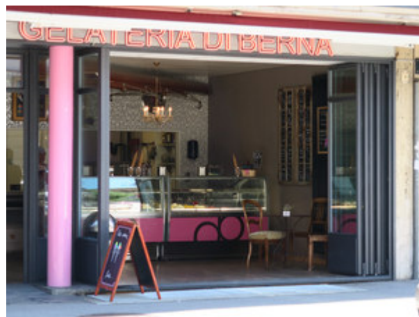
Gelateria di Berna

Then you continue to walk along Schützenweg until you get to Scheibenstrasse , where this walk ends. Here I'd like to point out one last thing: The Gelateria di Berna. It is located at Scheibenstrasse 18 and they serve homemade ice cream, which is really good! It is point C on the map.