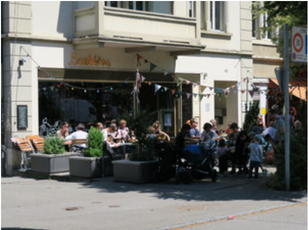
The bakery Bohnenblust